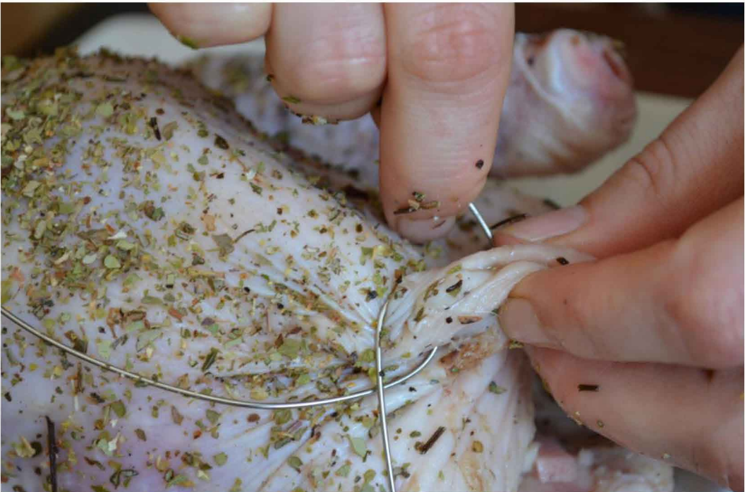
Pictured Above: Secure the cavity to ensure stuffing doesn't fall out while cooking