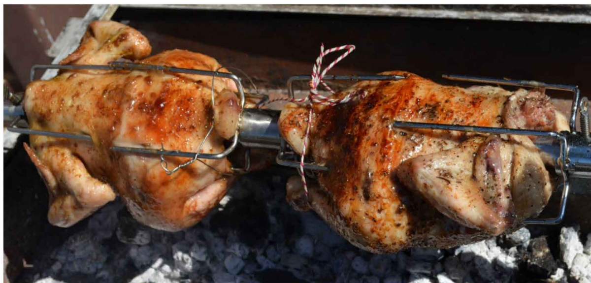
Pictured Above: Almost ready for carving